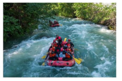
14-17 years old Min. height: 1,40m